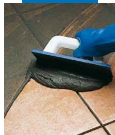
Grouting single-fired tiles with a float