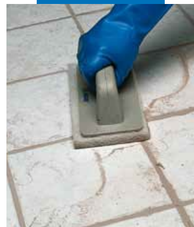
Finishing with a Scotch-Brite® pad