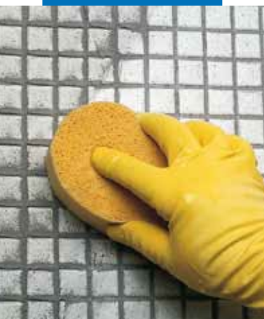
Finishing a glass mosaic with a sponge