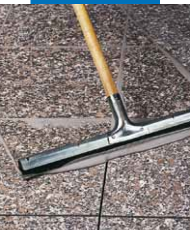
Grouting of pre-smoothed and glossed granite floor with rubber float