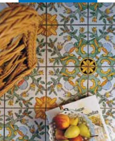
An example of a grouted double-fired tile floor