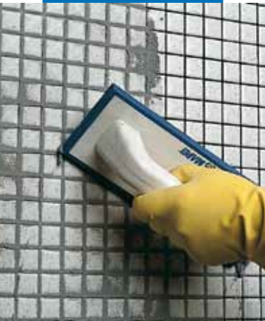
Grouting a glass mosaic (bathroom) with a float