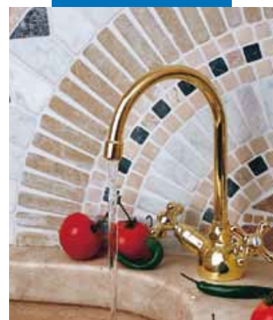
An example of a grouted mosaic tile kitchen